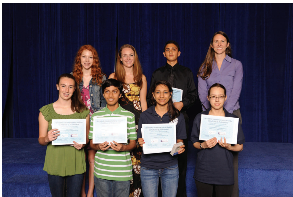
2011 Science & Engineering Fair of Houston Award Winners